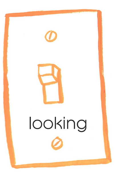
stick to a familiar environment

All light, especially fake light, wakes us up. Light makes us cast our eyes about and analyze things, process possible threats, and make decisions. In labor, light interferes with the hormonal orchestration.